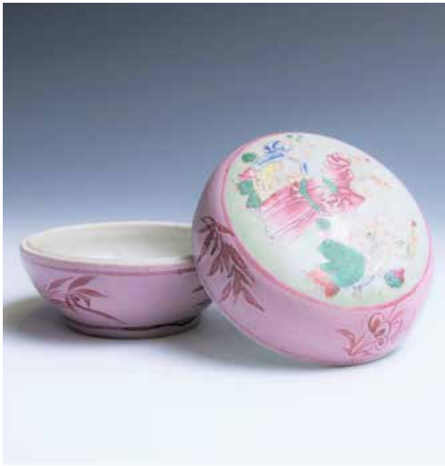
013 晚清 粉彩人物小盒

Of circular form, the domed cover decorated with children playing, the box decorated with bamboo leaves, and chrysanthemum, red Jianding seal mark on the base. Diam:9.6cm