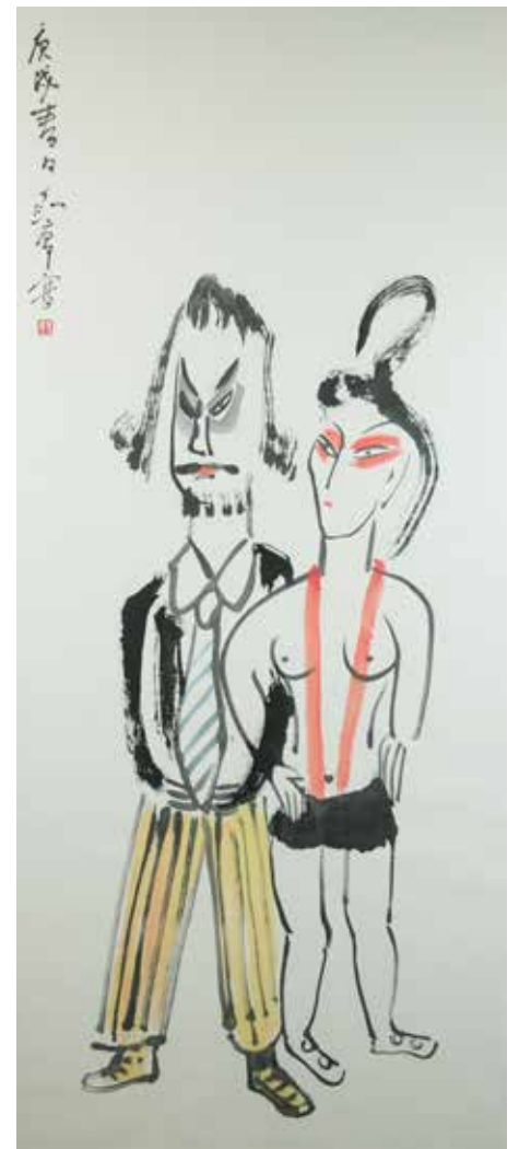
044 丁衍庸 (1902-1978) 人物 镜心 设色纸本

Signed and inscribed in Chinese, stamped with the artist's seal, depicting a male and a female figure, ink and colour on paper. 60.5cm x 138cm