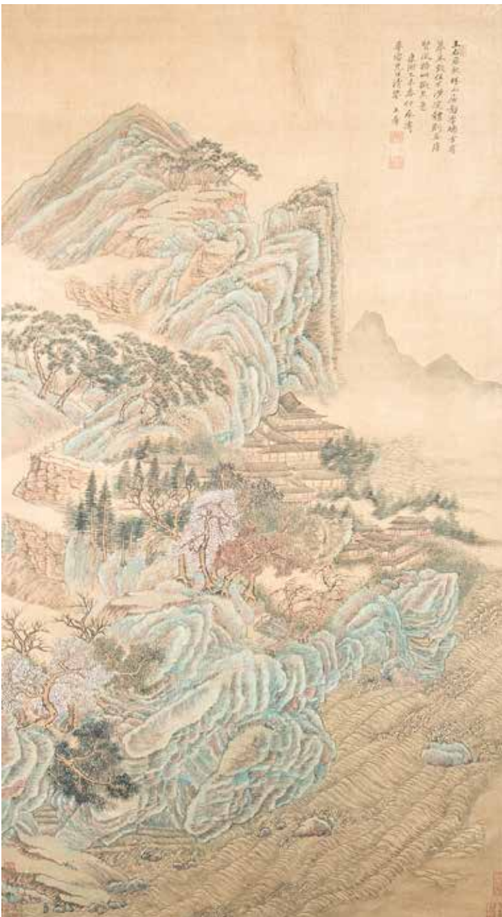
043 王翠款 山水人物 镜心 设色纸本

Depicting a mountain with rocks and trees and houses, signed Wanghui, with three artist's seal mark and five Shou Cang seals, framed, color and ink on paper. 120cm x 59cm without frame