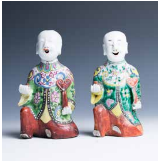
057 十九世纪晚期 粉彩男童像对

A pair of export famille rose models of boys, depicting two seated boys, each wearing colourful robes and with a circular aperture on the top, unglazed base reveals the buff-body. H:16.5cm, 17cm