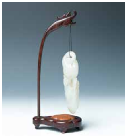
186 清 白玉 '蝙蝠寿桃' 挂饰带架

Carved with a bat resting on two peaches, the stone of white tone, hanging on a wooden hanger which carved with a dragon head. Jade H: 8cm