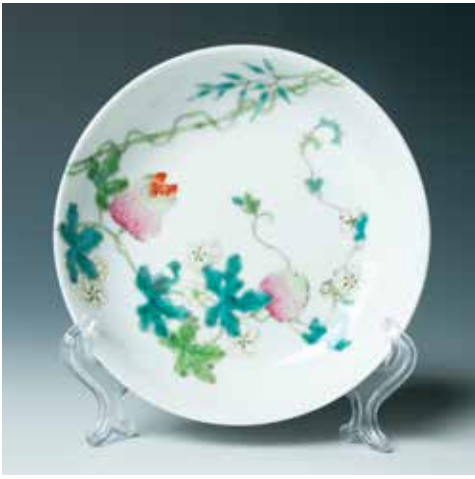
121 粉彩荔枝盘 《大清嘉庆年制》款

Of round shallow sides, the interior painted with two detached branches of lychee and flowers, the exterior painted with similar design with a butterfly, the base with six-character Jiaqing seal. Diam:14.5cm