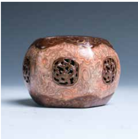
028 清 仿木纹鼓式镇纸

Of hexagonal drum shape, pierced around the body with beast symbol and pierced top with 'coin' shape, covered with russet and brown glaze, top and lower body decorated with gold interlaced flower pattern, the body decorated imitating agate. H: 6cm W:8.5cm