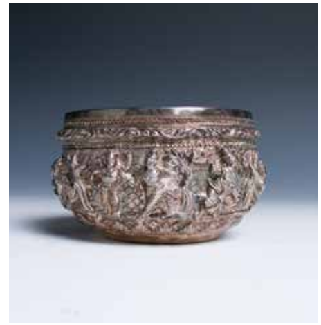
006 十九世纪 刻花银小罐

Of circular bellied form, the body embossed with kneeling and standing figures amongst threes, background decorated with the changing colour fish-scale pattern. H:13cm Diam:8.5cm