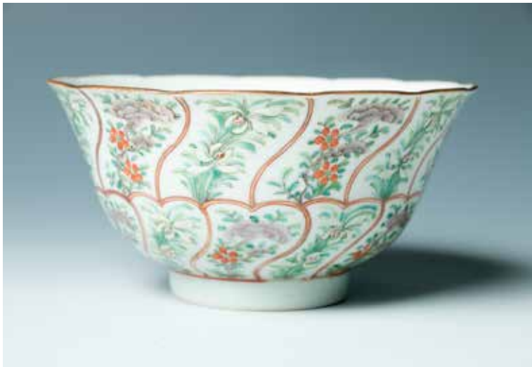
193 粉彩锦葵纹碗 《大清嘉庆年制》款

The deep rounded sides rising to a lobed rim, the exterior decorated with repeated flower and Ganoderma design, the base with six characters Jiaqing seal mark. 13.5cm