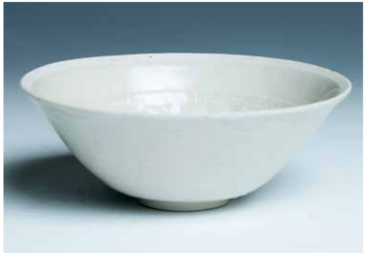
144 十一至十三世纪 白釉暗刻花纹碗

Of 11th to 13th century, the finely potted conical body slightly flared at the rim with six notches supported on a low cylindrical foot, the inside confidently carved with flowering leafy lotus stems, the translucent, very pale greenish-blue glaze extending over the foot and stopping short of the otherwise unglazed base. Diam:15cm