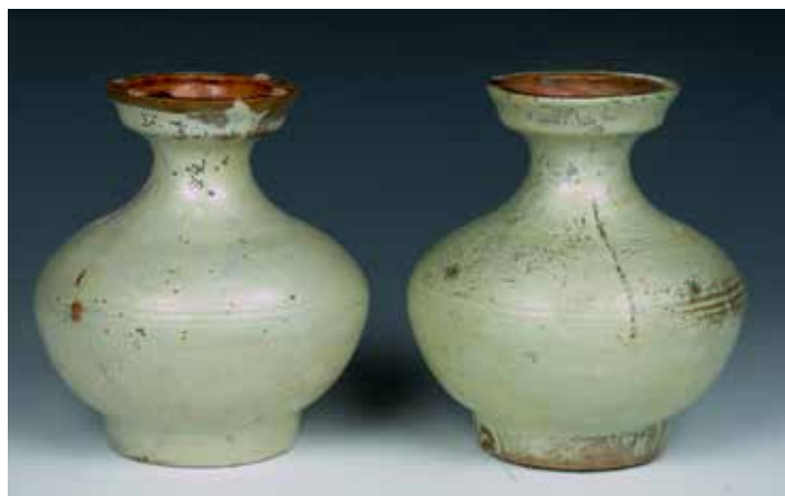
140 汉 绿釉罐一对

Each boldly-potted jar moulded around the body with paralleled lines, the waisted neck rising to a wide everted rim with glaze drips, supported on the flat glazed base, the interior with an amber glaze, the exterior in a deep olive-green glaze almost entirely turned to a pale green iridescent surface. H:19.5cm