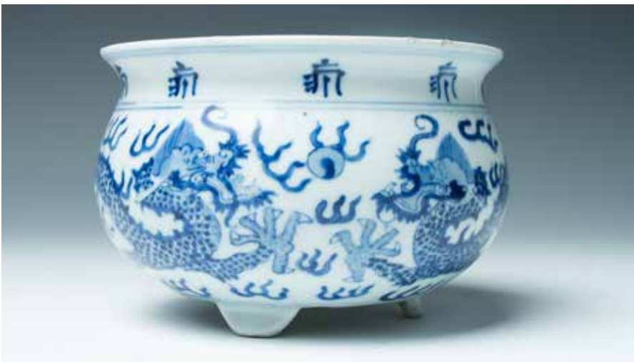
145 清 青花龙纹香炉

The compressed globular body rising to a waisted neck and an everted rim, all supported on three tapered feet, the exterior decorated with two dragons playing with a pearl amidst flames. H:10cm Diam:13.2cm