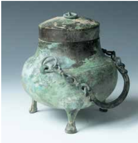
172 汉 青铜三足提梁壶

Of compressed globular body rising to a cylindrical neck and upright rim, all supported by three slim legs, two loop handles at the side suspending loose rings attached to the double-chain connected to a handle with a mythical animal head at the end, the domed cover cast with a ring knob at the top. H:17.5cm