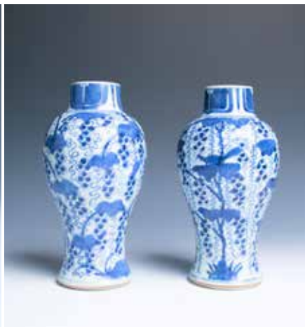
029 十七 / 十八世纪 青花直口瓶一对

The rounded sides rising from a spreading foot to a straight mouth, both vase overall decorated with grape vines and hanging vines. H: 24cm