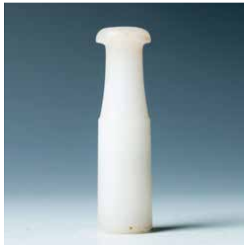
184 清 料器烟嘴

The Cigarette-holder carved from a smoothly polished Peiking Glass material of an even white colour. L:6.7cm