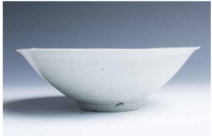
200 宋 暗刻纹青花碗

Of conical form, the wide flattering sides supported on a short straight foot, interior deftly carved with branches pattern, covered overall in a pale celadon glaze save for the underglazed base revealing the buff-coloured body. Diam: 18.5cm