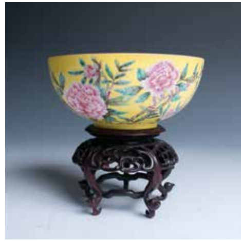
027 黄地粉彩花卉纹碗 《雍正御制》款

The deep rounded sides rising from a short foot, the exterior densely wreathed in pink and green poney with branches, all against a bright yellow ground, the white interior with no decoration, the base with a four-character 'Yong Zheng Yu Zhi' seal mark in blue. Accompanied by a wooden stand. Diam: 14.1cm