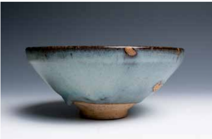
177 元 / 明 均瑶系天蓝釉紫斑碗

The deep sides rising from a short foot to an upright rim, covered overall with a sky-blue glaze punctuated with pale purple splashes to the interior, the glaze falling short of the foot to reveal the buff ware. Diam: 19 cm