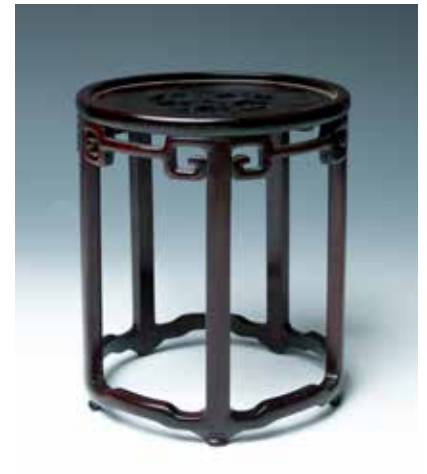
110 二十世纪 圆形花梨支架

of cylindrical form, the top circular panel carved with circles mimicking flower, the stand supported by five legs. Largest Diam: 14cm H:16cm