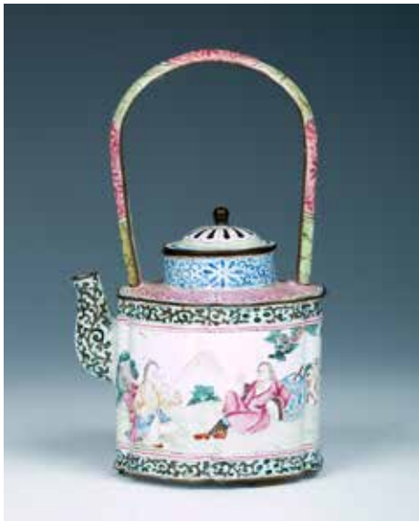
100 十九世纪 出口广州珐琅欧洲款茶壶带盖

The lobed sides painted in famille-rose and iron red enamels with European figures in landscape settings, set between borders of tendrils in black on pale lime-green hands above and below, the colour scheme repeated on the rest of the ewer, cover, spout and slender arched handle, the domed cover with everted rim and a knob finial raised on four bracket supports, some restoration to handle. H:17.5cm