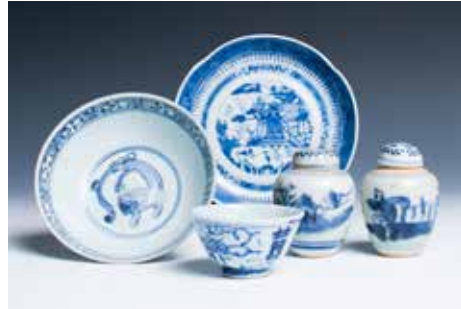
005 明 / 清时期 出口青花小瓷器一组

Comprising two jars with covers, two well-shaped dishes and a small teacup, landscape dish is 18th Century, double happiness cup 19th Century, pair of ginger jarlets and dragon bowl, 17th Century, 5 Pieces. Largest dish diam: 14.5cm