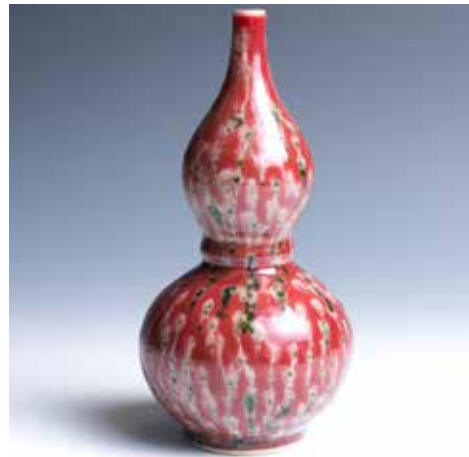
038 窑变釉葫芦瓶 《大清雍正年制》款

The globular lower bulb rising to a tall upper bulb and a long waisted neck, all supporting on a short foot, covered with red, russet, and green glaze, six-character Yong Zheng mark on the base. H: 21cm