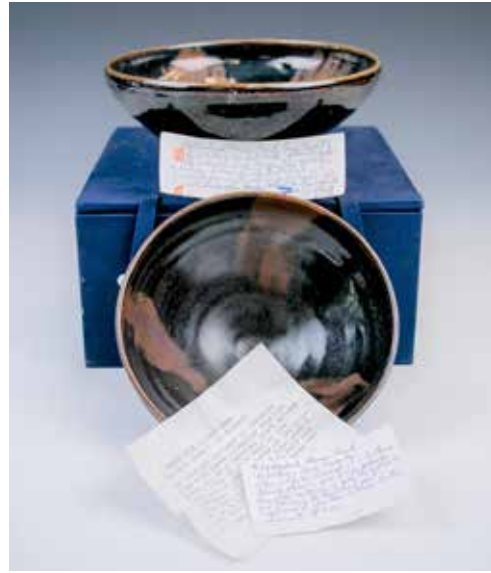
206 北宋至金 河南窑黑釉酱斑碗

The interiors splashed in reddish brown with three irregular poutine spots, all on a lustrous black ground below a line of iron-rust at the upcurved rim and repeated on the exterior where it pools in a line atop a thin iron rust which falls halfway of the knife-cut foot to expose the buff ware; The other with deep rounded sides rising from a straight foot to a slightly incurved lipped rim, applied with a black glaze with five splashes radiating from the center of the interior, the glaze to the exterior stopping irregularly above the foot to reveal the buff body. Diam: 20 & 17 cm