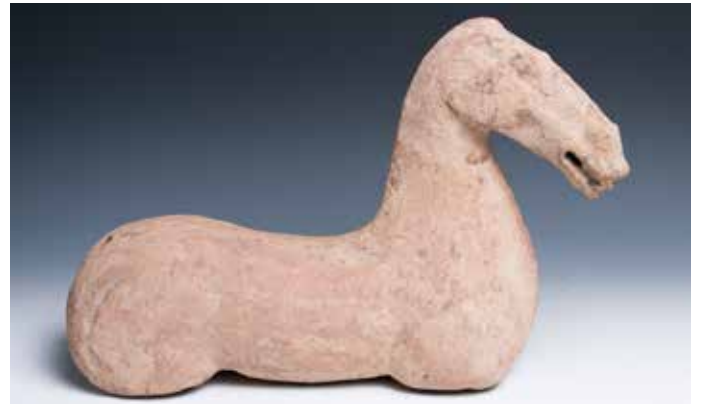
165 宋 灰陶土侍从像一组三件

A set of three pottery figure, with unproportioned big head, face detail lively carved, all wearing similar long rope, with hands crossing in front of their chests. H: 26.5cm