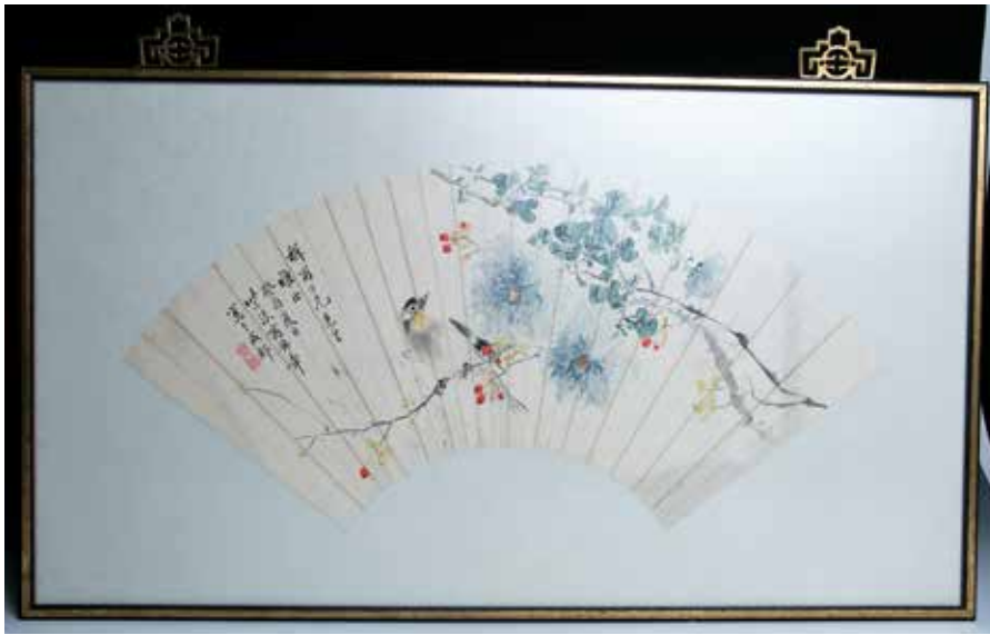
047 花鸟扇面连框 设色纸本