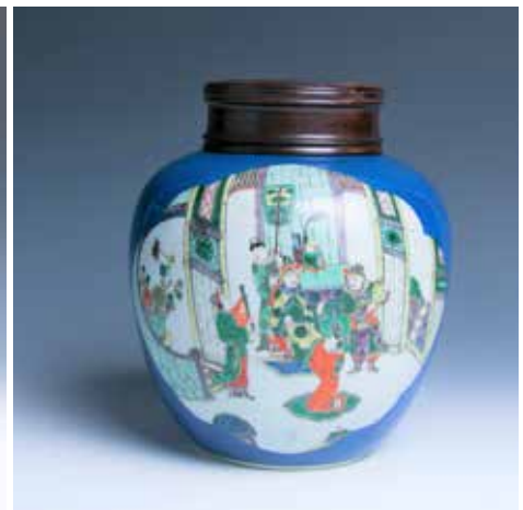
030 十九世纪中 蓝地五彩人物罐 带木盖

Of tapered-globular form rising to a short straight cylindrical neck, the body painted in famille-verte enamels with scenes of officers in an interior and the reverse painted with poney and branches, all against a blue ground, the interior and base glazed white, accompanied with a wooden cover, with marks of repairment. H:21cm.