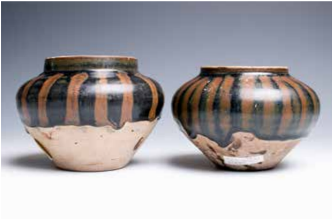
209 北宋至金 河南窑棕釉罐

The well potted globular body decorated on the exterior with thick black glaze with brown coloured striped, stopping short in drips over the unglazed buff, the interior with the black glaze with the mouth unglazed. H: 10 & 11.5 cm