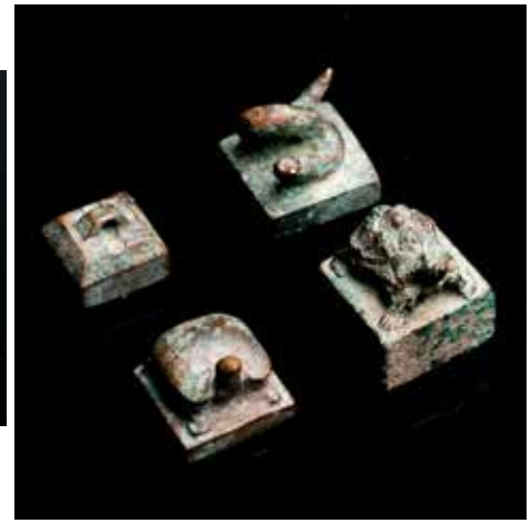
091 汉 铜制小印章一组四件

Four small bronze miniature seals, of square form, with characters incised, the back of the seals raised to form two turtles, a snake and a handle, all with a hole pierced through it. H:0.5 cm