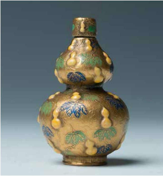
104 葫芦形鼻烟壶 《乾隆年制》款

The upper and lower bulb decorated with the double gourds, leaves, and vines, the bottle overall of gold colour, with decoration in yellow, blue, and green, all supported on a short foot, the base with four-character Qian Long seal. H:6cm