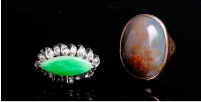
157 戒指 两件

A set of two rings, inlayed with different gems.