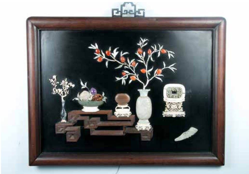
128 清 百宝嵌挂屏

Embellished with the motif of 'The Hundred Antiques', including panels, and various vessels filled with flowering branches, all applied with various hardstones, jade and bones. W:85cm H: 64cm