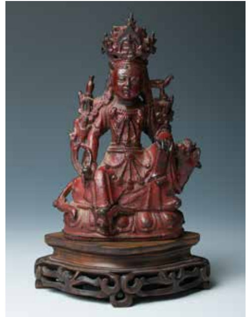
095 明 观音铜像

The bodhisattva seated in rajalilasana, the right arm resting on the knee, the left hand holding a small piece of the cloth, wearing a long rope with a robe fitted around the hip and beaded chains dangling below the knee, a tiara set against the high chignon, the face with well defined features. H: 17.5cm