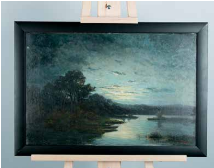
009 二十世纪中期 印度尼西亚油画

Painted by an Indonesian artist, with oil paint, depicting an evening landscape, overall of greenish - blue tone, signed with red paint on the lower right corner. 61.5cm x 41cm without frame