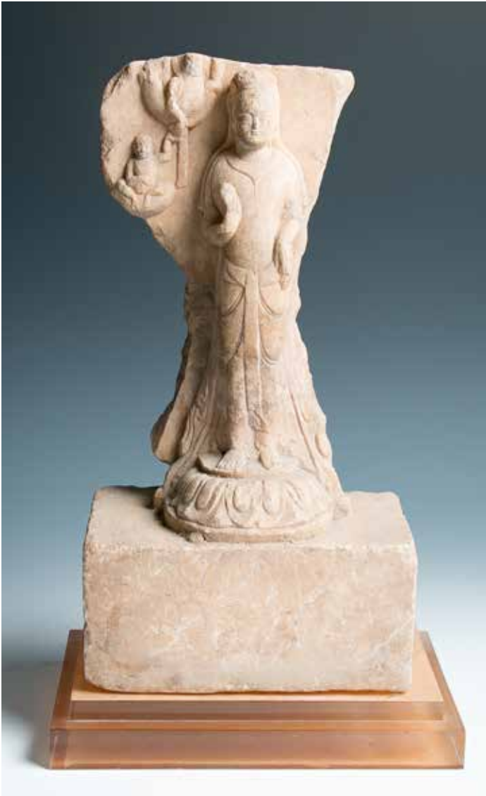
073 北齐 石雕佛像

Northern Qi Dynasty, carved on the limestone in high relief with figure of a Bodhisattva, the figure wearing a long rope standing on a lotus base with barefoot. H:38cm