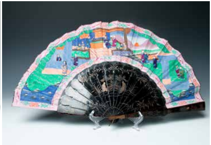
107 十九世纪 出口 黑漆彩绘人物庭院图折扇

The guards and sticks decorated with lacquer black ground in a garden, the fan leaf brightly painted on both sides with figures in interior an garden setting, each figure with finely detailed pink faces and clothing. L:28cm