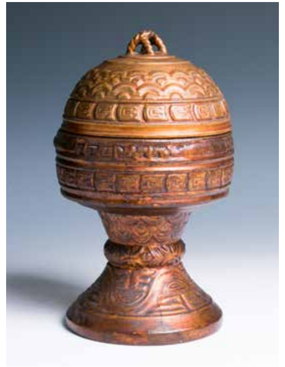
010 十九世纪 镀金佛教器皿盖豆

A gilt Buddhist vessel, the deep rounded sides rising to a straight rim, supported in a columnar base encircled with a raised band and terminating in a flared pedestal foot, surmounted by a conforming dome cover, with a knot shape knob. H:27cm