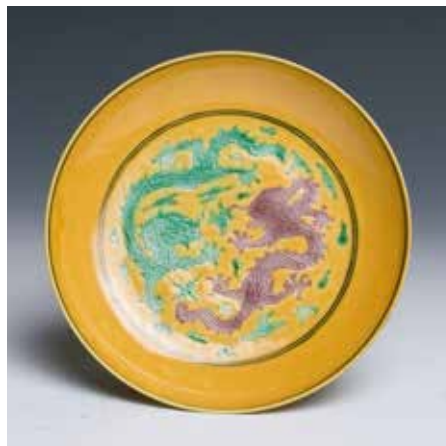
139 黄地紫绿彩云龙争珠盘 《大清康熙年制》款

With shallow rounded sides rising from a short foot, the interior decorated with two dragons soaring around a 'flaming pearl' amidst flaming wisps and ruyi clouds. Rendered in green and aubergine enamels against a yellow ground, the base inscribed with a six-character mark within a double circle. Diam: 14cm