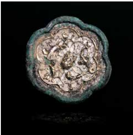
092 唐 花瓣形虎纹蟾蜍钮铜镜

Well cast, of six-lobed form, the gilded central knob enclosed by four lions and interlaced flowers. H:6.5 cm