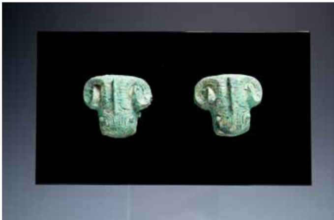
170 西周 青铜公羊面具

Each with curled horns and forehead with raised flange, eyes on either side, incised with stylized scroll motifs, green malachite encrustation overall and traces of azurite. H: 6.5 cm