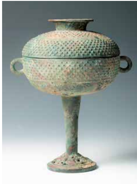
173 汉 青铜点纹豆

The deep rounded body supported by a stem and flared foot, carved with dragons, flanked by two loop handles on the sides, the cover centre with a flaring knob. H: 24.5cm