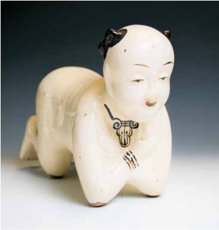
001 十九世纪 磁州窑童子瓷枕

A Cizhou porcelain pillow, in form of kneeling boy, bent over and leaning on his elbows, the hair in twin top knots, with a blissful smile on his face, one leg has been repaired. L:35.5cm