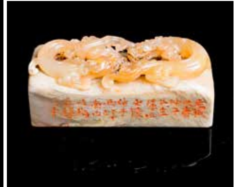
084 民国“黄土陵 (1849-1908)”刻“丁仲子”属 杜陵石龙纹印章《壬寅元春仲子先生属正士陵作于两峰南岸之梅花楼之中》款 印文:《静悟禅》

The russet stone sensationally worked and polished in the form of a rectangular section, surmounted with two dragons facing towards each other, the side carved with "Ren Yin Yuan Chun Zhong Zi Xian Sheng Shu Zheng Shi Ling Zuo Yu Liang Feng Nan An Zhi Mei Hua Lou Zhi Zhong", the seal face carved with three-character seal. L: 7.5cmW:3cm H:2.8cm Weight:135 grams