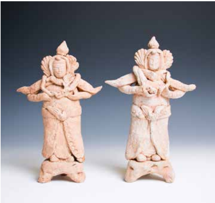
096 唐 陶制守护神像对

A pair of pottery figures, both wearing similar clothes with the same gesture, depicting with a long rope and big head decoration, standing on a tripod support. H:27cm