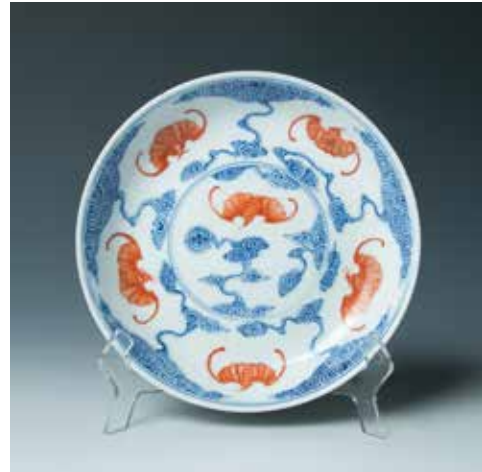
124 青花矾红 '蝠纹' 盘 《大清光绪年制款》

A blue, white and copper red porcelain dish, painted in delicate shades of iron-red depicting auspicious bats amidst cobalt blue clouds, the base with six-character Guangxu seal mark in blue. Diam: 19cm