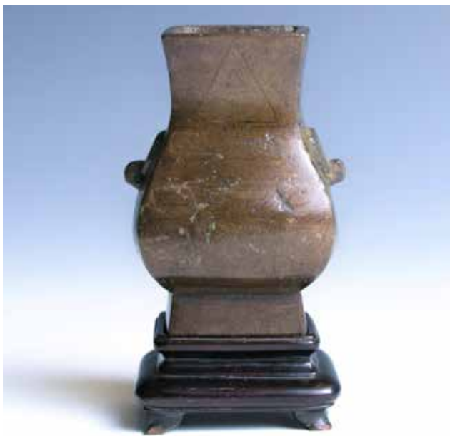
011 宋 铜制小耳方瓶 带底座

Of square section, the baluster body rising to a slightly flared rim with cusped corners, flanked by two loop handle decoration, made with bronze, accompanied with a fitted wooden stand. H:6.5cm W:4cm