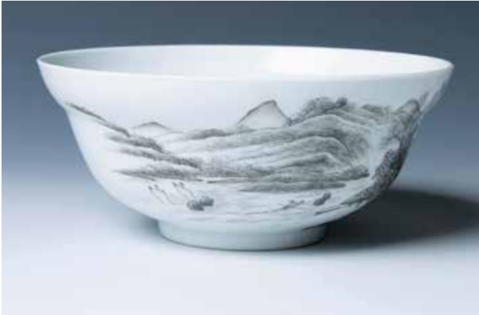
203 民国 灰色山水大碗 《洪宪年制》款

The Republic period bowl of deep side with an everted rim, the bowl decorated on the exterior with grisaille landscape design, including mountains, trees, lake and pavilion, the base with four-character Hongxian seal mark. Diam: 16.6cm