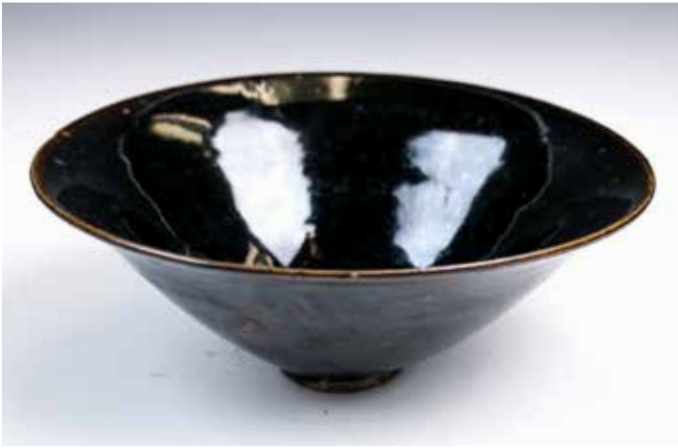
205 宋 黑釉茶盏

Of conical form, rising from a small foot to a flared rim, body with a rich black glaze, with traces of brown splashes, the unglazed base reveals the buff ware. D: 17 cm