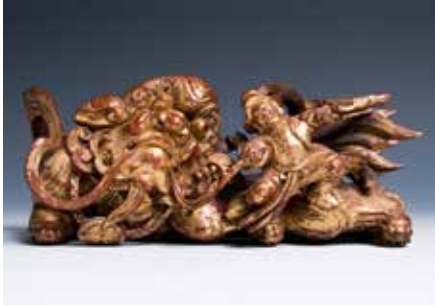
004 十九世纪 金漆“福狮与随从”建筑遗件

Of rectangular form, pierced and carved in high relief, depicting a figure and a beast, gilt on the surface, the base and the back reveals the wood. 21.5cm x 8.5cm x 7.5cm