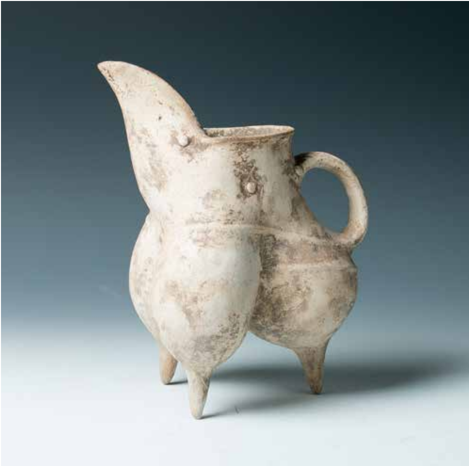
098 大汶口文化晚期 / 公元 3000 年前 白陶鬶

Possibly late Dawenkou Culture, 3rd Millenium BC., the lower body formed from joining the three legs, each swelling from small pointed foot to a broad rounded section, a simulated rope band around the widest point below the hemispherical upper section, the neck set at one side and joined to the other side by a long loop handle, the lip flared and pinched to form a long upward pointing spout. H:26cm