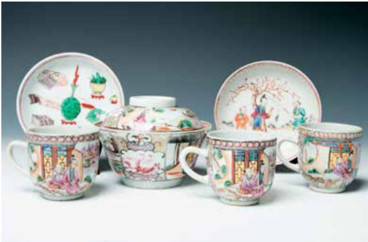
215 十八九世纪 出口瓷器一组

A set of five porcelain ware, comprising two plates, three teacups and one tea bowl with cover, the cups, bowl, cover are decorated with figures within the interior scene, one plate painted with the figure within a garden scene and one with depictions of different objects. Plate Diam: 12.5cm