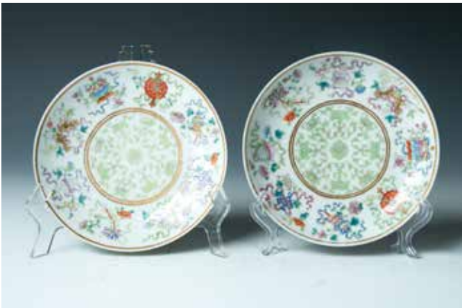
152 粉彩 '八吉祥' 纹盘一对 《大清光绪年制》款

Each dish is decorated to the interior with a central roundel enclosing elaborate lime-green enamelled lotus scrolls, all encircled by the Eight Buddhist Emblems, Bajixiang, the interior is enamelled with three floral sprays, the base with Guangxu six-character seal in iron red and of the period. Diam: 14.6cm