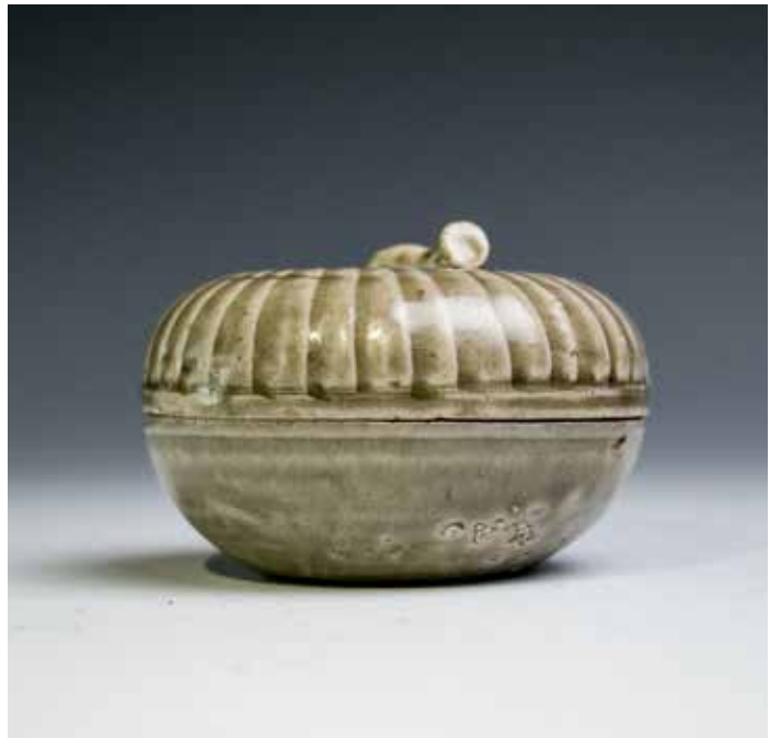
208 西晋 越窑橄榄釉 '南瓜' 盒带盖

Of circular section, the cover moulded with a pumpkin shape, the body glazed with an olive colour, the body decorated with small cracks. D 10 cm