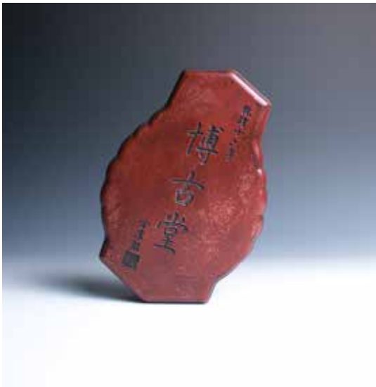
037 “博古堂”款 砚连盒

The inkstone of symmetrical form, carved with calligraphy, of black colour, with a circle water pool in the centre, all enclosed in a fitted wooden box and cover titled 'Bo Gu Tang'. W: 18.6 H:27cm