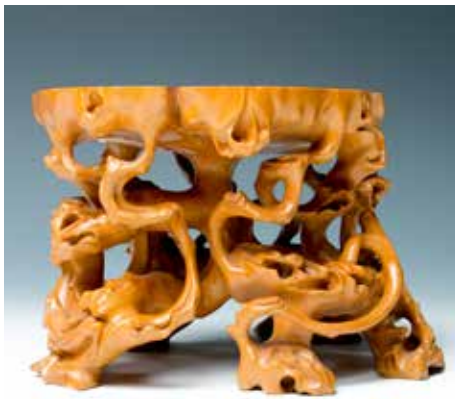
148 二十世纪 染色仿树根支架

Of upright cylindrical form, carved shape mimicking wood root, stained yellow. H:13cm