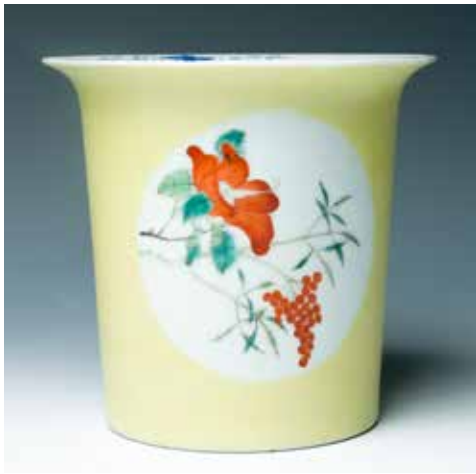
113 黄地粉彩花盆 《大清洪宪年制》款

A famille rose porcelain planter, painted with the floral design on two panels, the base with two circular apertures and four-character Hongxian mark in iron red and of the period, H: 16.5cm Diam:18cm