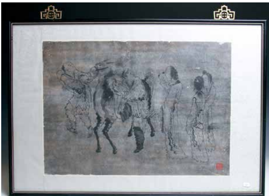
049 人物与马 镜心 水墨纸本

Depicting two men, four women, a child and a horse, ink on paper, framed and under glass, with one artist's seal. 44cm x 30.5cm without frame