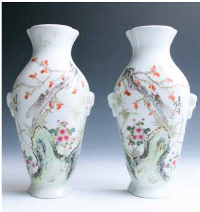
015 粉彩挂瓶一对 李明亮款

Each with a flat-backed pear-shape body rising from a spreading foot to a barbed rim, flanked with two ring handles, symmetrically painted with the cicada, scholar's stone, and magnolia. H: 21.5cm each