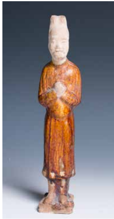
163 唐 橘釉陶制侍俑

Well-modeled, standing attentively, hands clasped in front of the chest, wearing a long rope with a tall hat. H:24.5cm