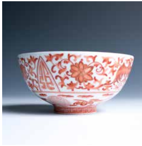
024 矾红蝙蝠花纹碗 《大清雍正年制》款

Of globular shape painted around the exterior in shades of iron red on the white ground with bats interlaced flowers, the base inscribed in blue with a six-character seal mark. Diam: 13.5cm H: 6.5cm