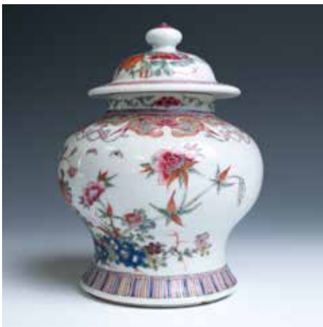
039 清 粉彩带盖小罐

Of compressed globular body raising to a short cylindrical neck, painted with interlaced poney and butterfly on the body all below a 'ruyi' pattern band, the neck with painted flowers and the foot with a lappet band, the cover similarly decorated, red 'Jianding' seal mark on the base. H: 14cm