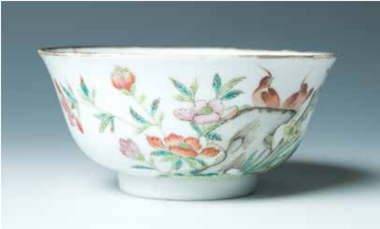
123 民国 粉彩动植物碗 《大清光绪年制》款

The Republic period bowl with deep rounded sides rising from a short foot to an everted rim, delicately painted to the exterior with flowers, trees, scholar's rock, birds, and butterfly, the interior decorated with a dragon chasing pear in the middle, the base with six-character Guangxu seal in the middle. Diam: 12.2cm