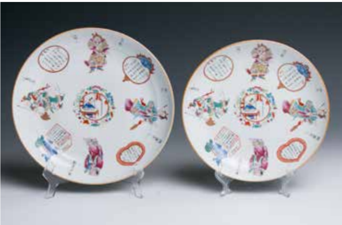
211 粉彩无双谱盘一对 《大清道光年制》款

Each painted to the interior with four heroes from the Qing Dynasty woodblock prints Wushuangpu [Table of Peerless Heroes], the centre depicting a female figure, the base with a six-character Daoguang seal mark. Diam:22cm; 25cm