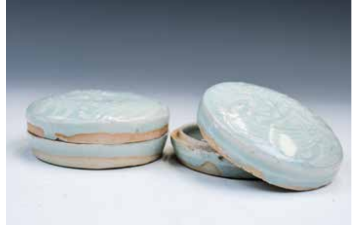
204 北宋 青白釉印花盒

Song Dynasyu, each of circular section, the cover moulded with double phoenix, the shallow side partly glazed, flaring from the slightly concave and unglazed base burn cream in the firing, covered inside and out with a light-blue colour, minor chips. Diam: 9.5cm