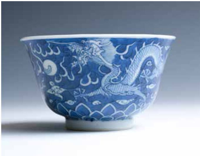
017 青花龙纹小碗 《大清光绪年制》款

Finely potted with deep rounded sides, outcurving at the flared rim, decorated with dragon playing ball, supported on a short straight foot, six-character 'Da Qing Guang Xu' seal mark on the bottom. H:6.5cm Diam:10.5cm