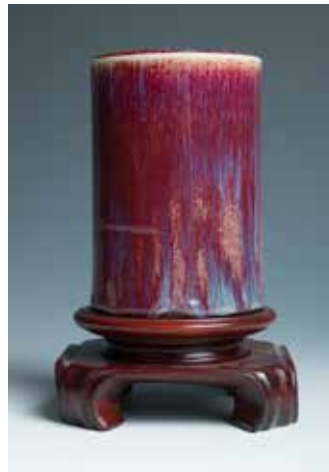
116 十七世纪 窑变釉笔筒带底座

Of cylindrical form, the body covered overall with a rich purplish-red glaze streaked with lavender blue, the glaze falling short to a buff-tone in the interior, the unglazed bottom reveals the buff-body, accompanied with a fitted wooden stand. H: 11cm Diam: 7.5cm