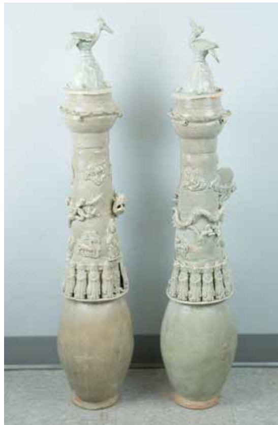
093 宋代 粮罐带盖一对

A Song Dynasty pair of granary jars, of ovoid body supporting on a short compressed circular foot, narrowing to a long tapered neck which decorated with high relief images, rising to a bulb-shape mouth and the domed cover with a bird on the top, the jar overall covered in pale green glaze, the unglazed base reveals the buff body. H:110cm Diam:15.5cm