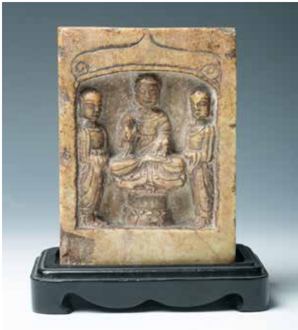
078 北周 保定佛像石碑

Both sides carved with Buddha seated in dhyanasana over the pedestal throne on which he sits dressed in heavy robes that fall in voluminous folds, the Buddha on one side accompanied with a pair of bodhisattvas wearing braided belts and low caps, and the other side has monks with bald head, Another side of the stele carve with words, accompanied with a fitted wooden stand. 5.5cm x 10cm x 15cm