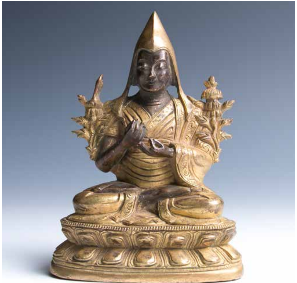
022 十八世纪 铜鎏金宗喀巴像

A gilt bronze immortal figure with a pointed hat and long rope. H: 14cm