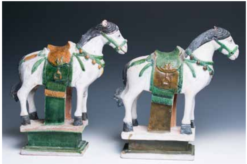
059 明 三彩陶马一对

Standing foursquare on a rectangular base with the head raised and held slightly to the left, the body with white glaze, one with the green-glazed saddlecloth draped over the high ridge saddle and gathered in pleats to either side, all over a yellow-glazed saddle blanket, the other has opposite combination. H:32cm W:38.5cm