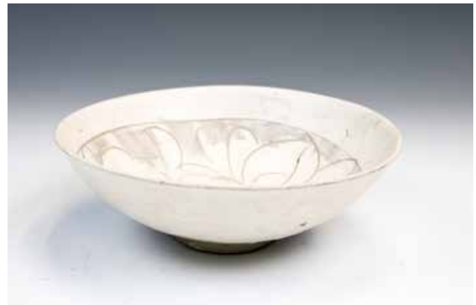
178 金 磁州窑白釉剔荷花纹碗

Of rounded shape on a straight foot rim of broad section applied with an almost colourless glaze over a creamy slip, the interior freely incised with a large stylised lotus on a combed ground. Diam: 21.5 cm