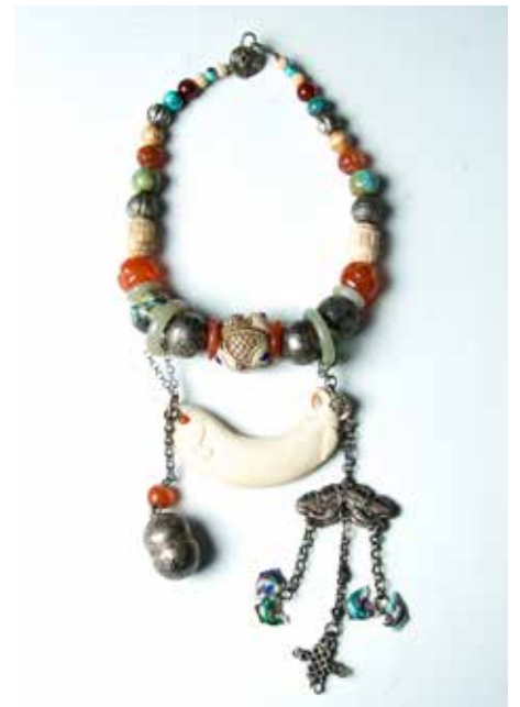
150 清 藏教银铃挂饰

An antique necklace, with a silver bell, pendant and turquoise beads also with other hardstones, decorated with fish shape hardstones, and bone decorations.