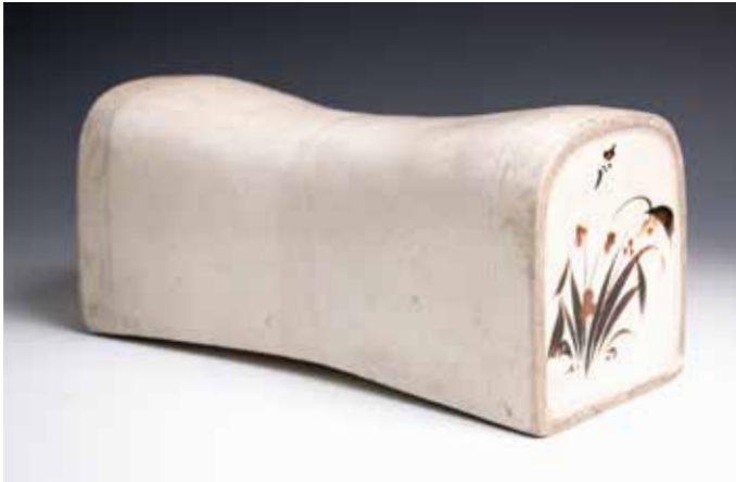
175 北宋至金 磁州窑瓷枕

Of rectangular form, with a flattened top, curved inward in the middle, two sides decorated with orchid, overall covered with white glaze and small cracks. L:33 cm