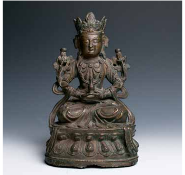
074 明 铜佛像

Seated with legs crossed in dhyanasana and both hands holding a vase, dressed in loose robes opening at the chest to reveal beaded jewels, all supported on a lotus flower base. H:27cm