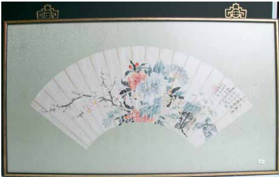
048 花鸟扇面连框 设色纸本

Depicting flowers including pomegranate, cherry blossom, etc. Ink and colour on the fan, framed and under glass, signed by the artist and with one seal of the artist.