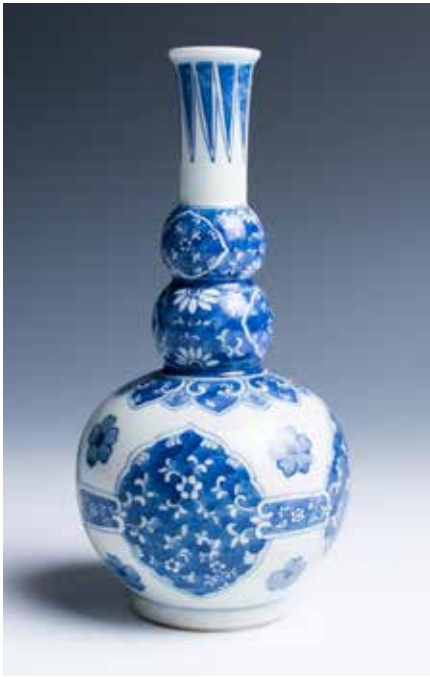
201 出口 青花葫芦瓶 《大清康熙年制》款

The blue and white porcelain vase of triple-gourd form rising to a long waisted neck, the body decorated with interlaced flowers, the base with a six-character seal mark. H: 19.5cm