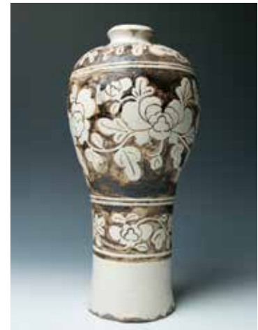
117 二十世纪 磁州窑暗刻 '牡丹' '梅瓶'

The elongated body is fluidly painted in brown on a white slip and under a clear glaze with a board band between two thinner bands of poney, the unglazed base reveals the buff ware. H:36cm