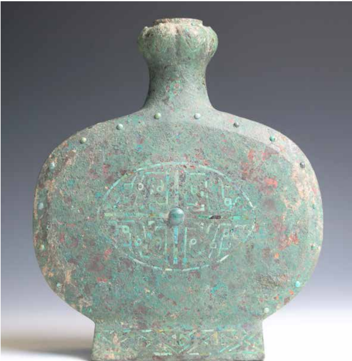
169 汉 绿松石嵌铜扁壶

Han Dynasty, of flattened oval form, supported on a spreading rectangular foot, the body inlaid with turquoise for decoration, the waisted cylindrical neck raising to an onion-ball mouth. H:22.5cm