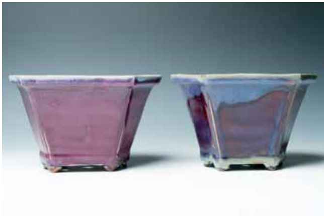
115 二十世纪 均窑六角形花盆一对

The deep, faceted sides of the oblong, hexagonal planter are raised on six slightly curved, low supports, and flare upwards to a thicker rim, it is covered in interior with thick bubble-suffused glaze of milky-blue tone thicker to purple tone on the exterior, the base which is unglazed, reveals the buff ware and pierced with five drainage holes. 14.5cm x 21.5cm x 13.6cm