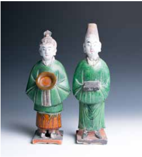
056 明 三彩人物像对

A pair of Sancai glazed figure, one female and one male, both dressed in long robes, standing steady with hands overlapped below the chest. H: 36.5cm, 35.5cm