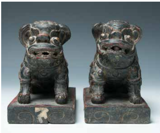
102 十九世纪 漆木雕佛教狮子像一对

Depicting two buddhist lion standing on a rectangular base, the body of the lion carved with decorative patterns, overall of black tone with red lacquer. 18.5cm x 11cm x 17cm