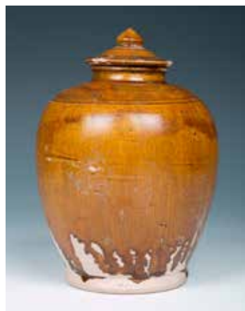
141 唐 橘釉罐带盖

Of ovoid form potted with a short neck and lipped rim, and covered overall with an orange glaze that falls short of the base to expose the buff ware, the similarly glazed, domed cover with everted rim is surmounted by a bud-form finial. H:22cm