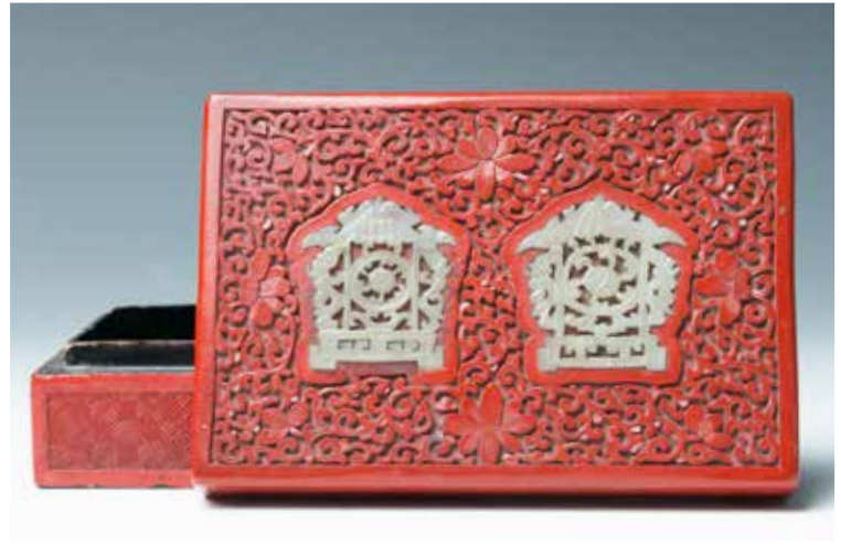
214 十九世纪 镶玉剔红盒

Of rectangular form, the flat upper surface carved with the interlaced floral pattern with jade decoration inlaid in the middle, the straight sides deftly carved with key patterns, the box similarly carved, the interior and base lacquered black. 10cm x 14.5cm x 5cm