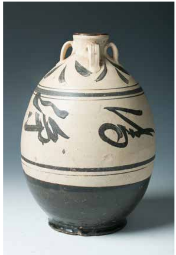
212 金 / 元 磁州暗刻大罐

The vase is decorated with four ribbed leaf-shaped handles to the neck, the upper body is covered with a cream slip with double band in brown glaze and with stylised character decorated the body. H:28cm