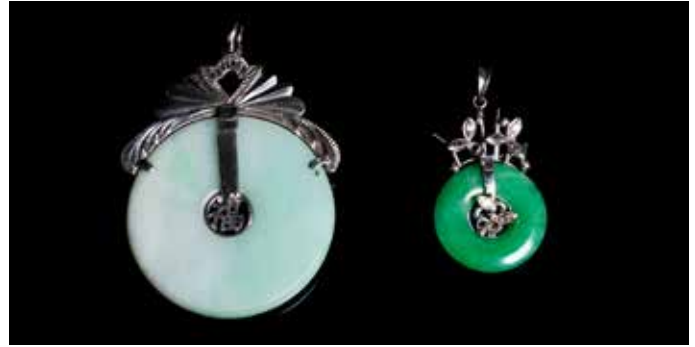
158 玉佩件 两件

A set of two jade pendant, the smaller one with a flower in the middle, the big one with 'fu' character in the middle. Diam: 1.2cm & 3.3cm