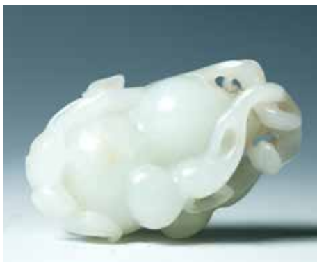
185 清 白玉葫芦挂坠

The pendant carved in the form of a large double gourd borne on stems suspending a smaller double gourd, the stone of pale celadon tone with russet marks. L:6cm W:3.2cm