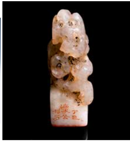
083 清“赵怀公”寿山冻石仿太湖石印章《丁巳怀公刊石》款 印文:《韵逸》

Of upright rectangular section, carved on Shoushandong Stone mimicking Taihu Stone, side with signature "Ding Si huai Gong Kan Shi", the seal with "Yun Yi", the stone of grey tone with black dots. H: 6.2cm