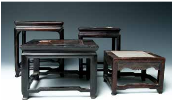
111 十九 / 二十世纪 方形硬木支架一组四个

A set of four wooden stands, all of the square form, made with hardwood, except one with a white stone in the middle, with varied sizes. Highest H:17.7cm