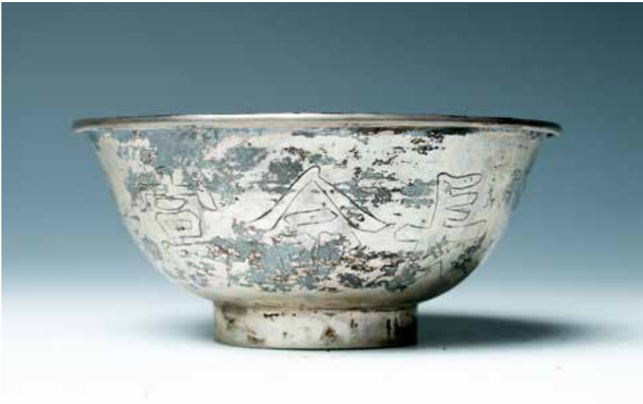
118 光绪 暗刻银碗

Incised with "longevity" character, bird and peony on the exterior, the bowl of circular form, supported on a short foot. Diam:10.7cm H:5cm