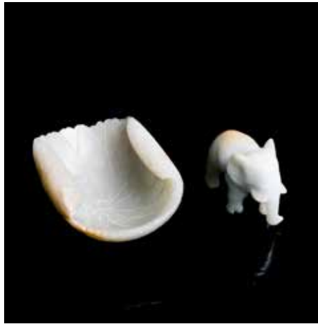
032 清 青玉荷叶笔洗带玉象

A set of two jade objects, one carved as a curved lotus leaf brushwasher supporting on a root-shape base, one carved as an elephant, both stones of celadon and russet tone. W:8.5cm, 5cm H: 3.3cm, 4cm