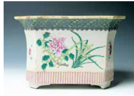
114 二十世纪早期 粉彩六角形花盆

Of flaring hexagonal form, decorated with chrysanthemum, plum blossom and butterfly design, all supported on four bracket feet. 28cm x 21.5cm x 20cm