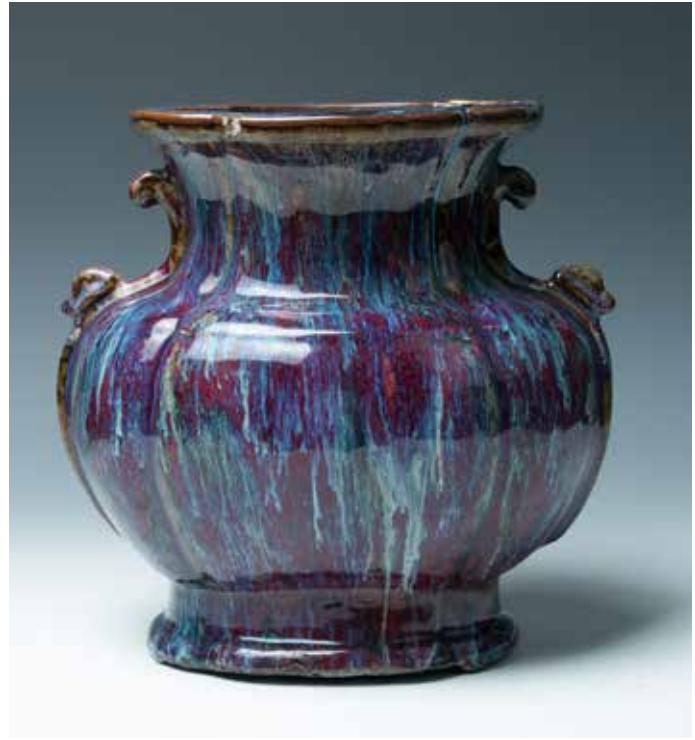
105 十八世纪 窑变釉瓶

Of four-lobed section with everted neck and foot, the body overall covered with a deep reddish-purple glaze with shades of blue and lavender in between the segments, the base glazed in a patchy brown, repaired with Japanese 'Kintsugi'. H:28cm