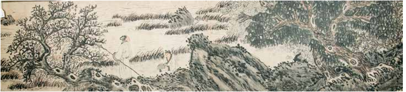
042 佚名 山水人物 镜心 设色纸本

Depicting a scholar and an attendant within a landscape scene, unknown artist, color and ink on paper.