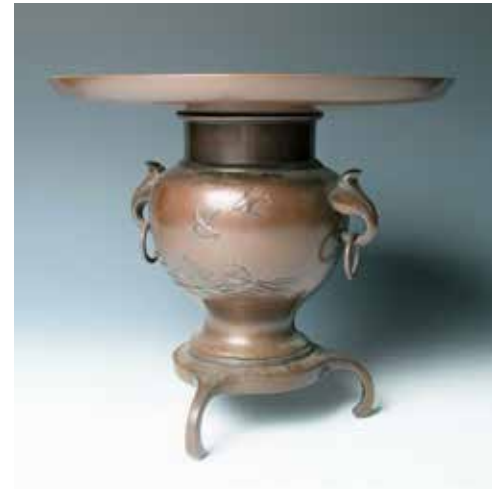
216 日本明治末期 青铜盘口瓶

Of usabata-style with tall straight neck and wide lip encircling the mouth, the vase includes two parts, the lower vase of the globular body rising to a cylindrical neck and an everted rim, accompanied with two handles attached on the shoulder and all supported by three legs, the body carved with landscape and birds. H:28.5cm D:30cm