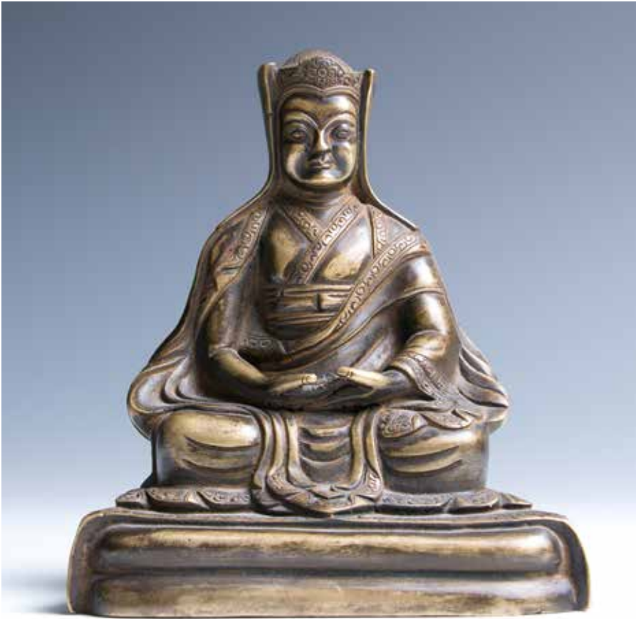
021 十七世纪 铜制哦干贡噶桑波像

A bronze immortal figure, collector's note identified as NGORCHEN KUNGA SANGPO. H:10.5cm