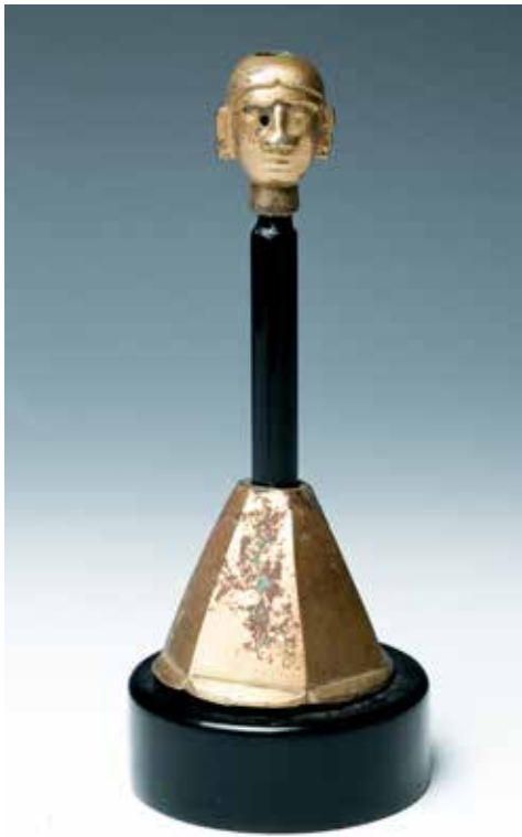
089 汉 鎏金铜头像

A gilt bronze figurehead, with two faces on opposite side, supported on a black stick with a conical gilt bronze base. H:17cm