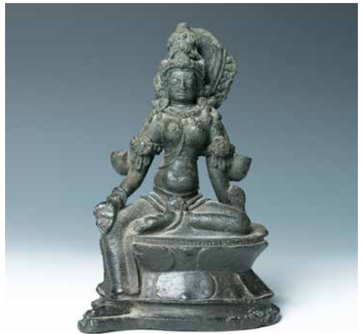
075 十三世纪 塔拉铜坐像

Seated in lalitasana on a double-lotus base, the face casted with down case eyes, one arm resting on her knees and the other placed at the back. H:21cm