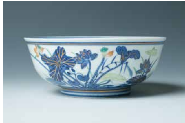
192 斗彩荷花池碗 《大清光绪年制》款

A framed calligraphy, with artist's photo, titled and signed with two artist's seal. H:65.5 W:29cm with frame.