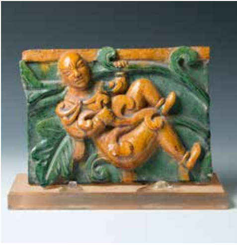
213 明 / 清 三彩釉人物瓷砖

The tile modelled with a figure hanging on a branch, decorated in shades of yellow and green. L:28.5cm