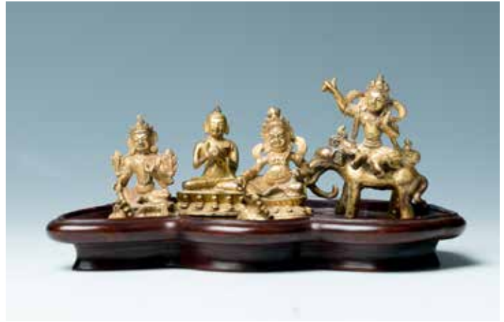
077 十九世纪 一组四件鎏金铜佛像

A group of four different gilt bronze Buddha, one sitting on an elephant, one sitting on a lotus base with leg crossed, the other two sitting in the similar gesture with one leg reach outward, together with a fitted stand. Highest H: 5cm