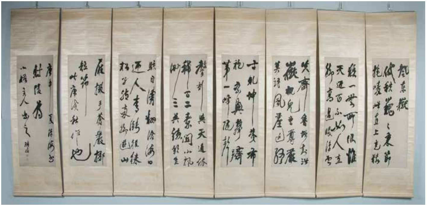
190 邓石如款 八条屏 立轴 水墨纸本

Total of 8 scrolls, ink on paper, signed with one artist's seal. 41.5cm x 123cm each