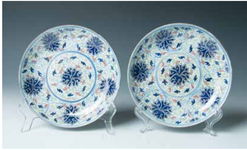
122 青花斗彩 '缠花纹' 盘一对 《大清宣统年制》款

Each with shallow sides and inverted rim, the interior painted with a central medallion of interlaced flower, surrounded by similar patterns, all against a white ground, the unglazed foot rim reveals the buff body, the base with six-character Guangxu seal. Diam: 16.5cm