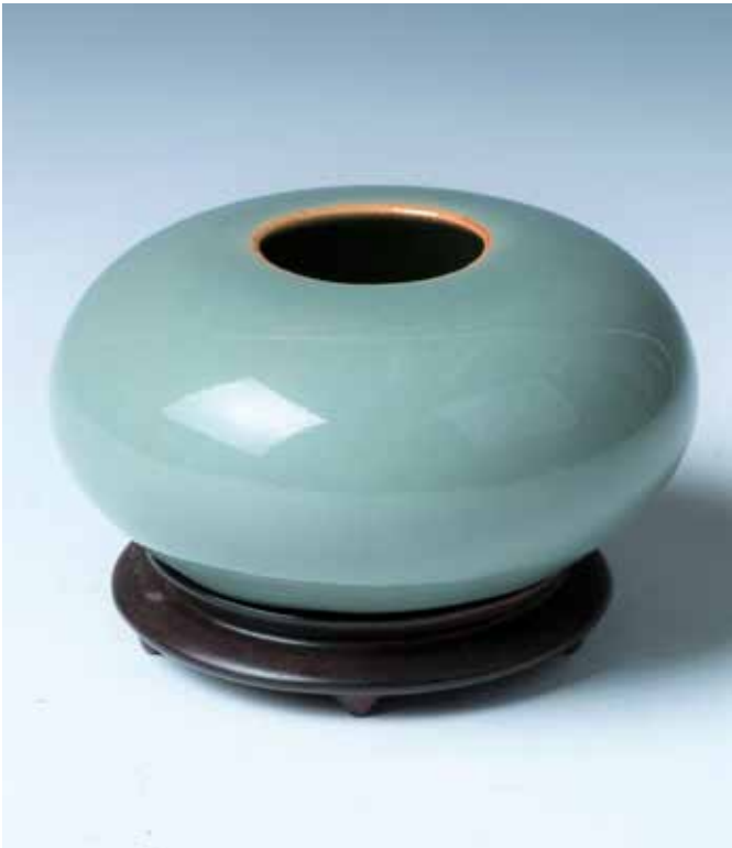
143 宋晚期至元 龙泉窑绿釉笔洗

Of late Song to Yuan Dynasty the brush washer finely potted of compressed globular form on a low foot ring, covered both inside and out with green glaze, with the rim and foot unglazed and shows the buff ware. Diam:9.5cm