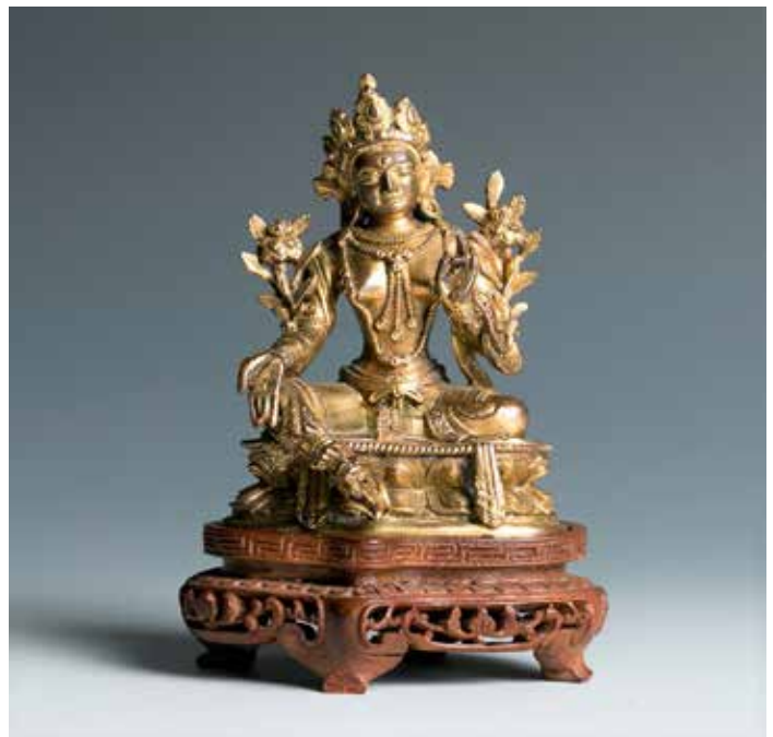
079 17 世纪 鎏金铜多罗菩萨像

A gilt bronze immortal figure with an initiation crown, sitting on a lotus seat, accompanied with a wooden stand. H: 12.5cm