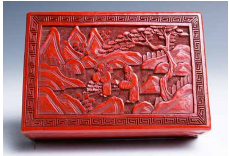
198 十九世纪 剔红雕漆人物山水纹长方盖盒

Of rectangular form, the flat cover deeply and crisply carved with a scholar strolling with his attendant carrying a bag on a stick, within a landscape of mountains and trees, the sides of the cover and the base carved with Greek key motif, the interior and base lacquered black. L:9.5cm W:14.3cm H:4.5cm