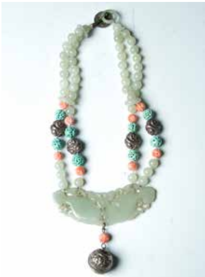
183 清 藏教青白玉银铃挂饰

An antique necklace, decorated with jade carved fishes decoration facing each other, along with jade beads and other hard stone beads.