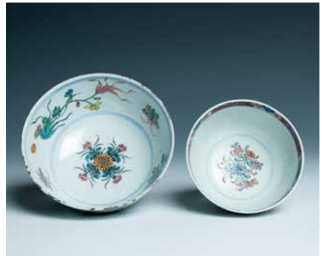
103 十七/十八世纪 出口粉彩青花碗一对

A group of two porcelain bowls, the exterior of the larger bowl painted with chrysanthemum, orchid, and hibiscus, the smaller one painted with two poney on the exterior, the interior each decorated with the floral design in the middle and the larger one with orchid and butterfly on the sides. Largest Diam: 15cm