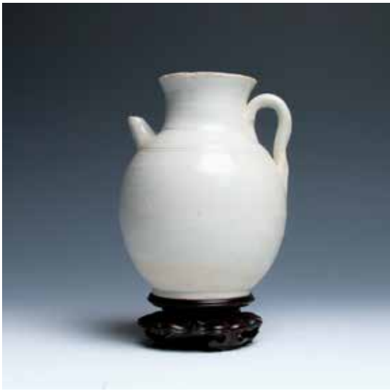
179 宋 白釉执壶

A white-glazed Ovid form ewer with simple waisted neck applied with a double loop handle, and a narrow cylindrical spout, incised with concentric horizontal rings at the shoulder, the ivory glaze stopping irregularly above the shallowly cut base. H:13.5 cm