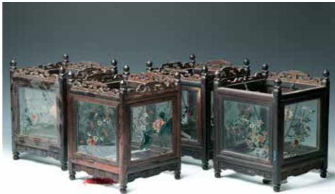
106 十九世纪 出口 镜画 '花虫' 灯笼一组

Each of upright square shape, the wooden frame folding around a central X-form hinged pivot, the four sides each enclosing a colourful reverse painted the domestic scene of flowers and insects, including poney, lotus, chrysanthemum, butterfly, and dragonfly. 18.7cm x 18.7cm x 28cm