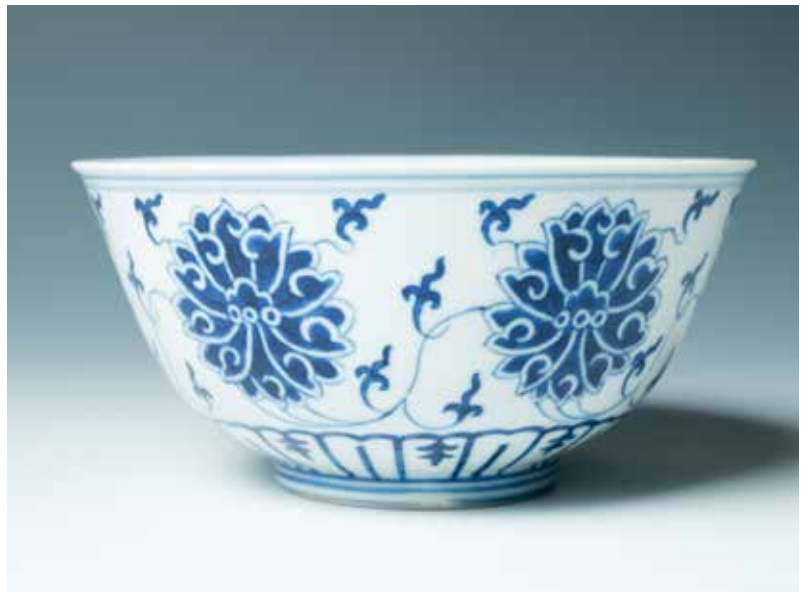
180 青花宫碗 《大清光绪年制》款

A blue and white 'palace' bowl painted with a frieze of lotus meander above a petal lappet band on the exterior and with a similar single lotus roundel in the interior, the base with six-character Guangxu seal. Diam: 16.1cm