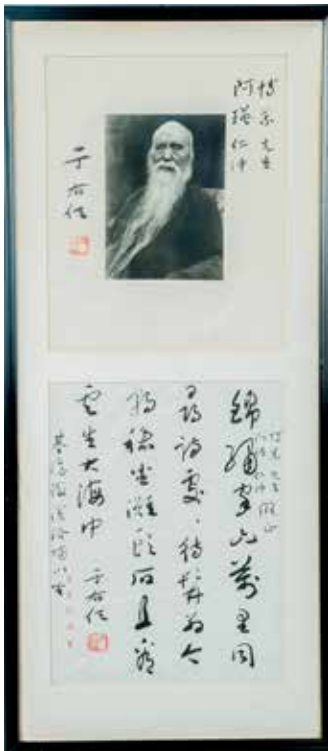
191 于右任 (1879-1964) 镜心 设色纸本

A framed calligraphy, with artist's photo, titled and signed with two artist's seal. H:65.5 W:29cm with frame.