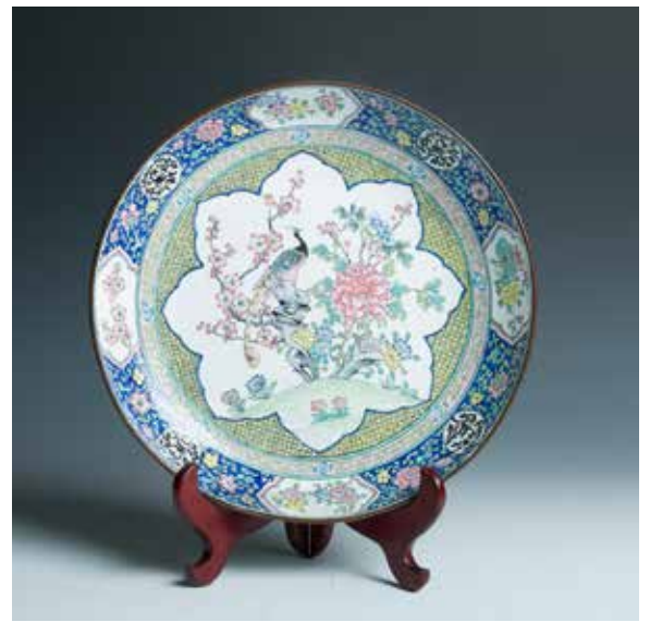
101 十九世纪 出口广州珐琅孔雀牡丹盘

Of large shallow rounded form, brightly enamelled to the interior centred with peacock and poney circled by two bands of decorative interlaced floral design, the exterior with yellow ground floral design on the sides and blue beast patterns on a white glaze ground on the base. Diam: 27cm