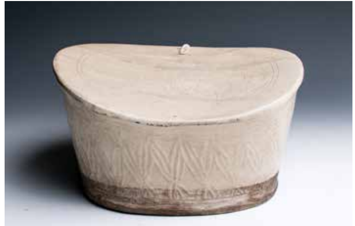
176 金 磁州窑牡丹枕

The body sculpted with an inward-tilting concave top carved with a large standing peony within a double line-border, the front and back panels of the sides moulded with a diaper ground, covered overall with an ivory tinted glaze, the base unglazed, one hair-line crack on top, some restoration on the rim. L:25 cm