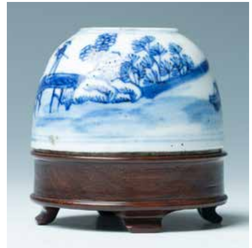
146 清 青花水盂

Of beehive form, the domed sides decorated with landscape scene, including three figures, a house, river and tress, with Jian Ding seal mark on the base, accompanied with a fitted stand. Diam: 5.5cm H:3.3cm