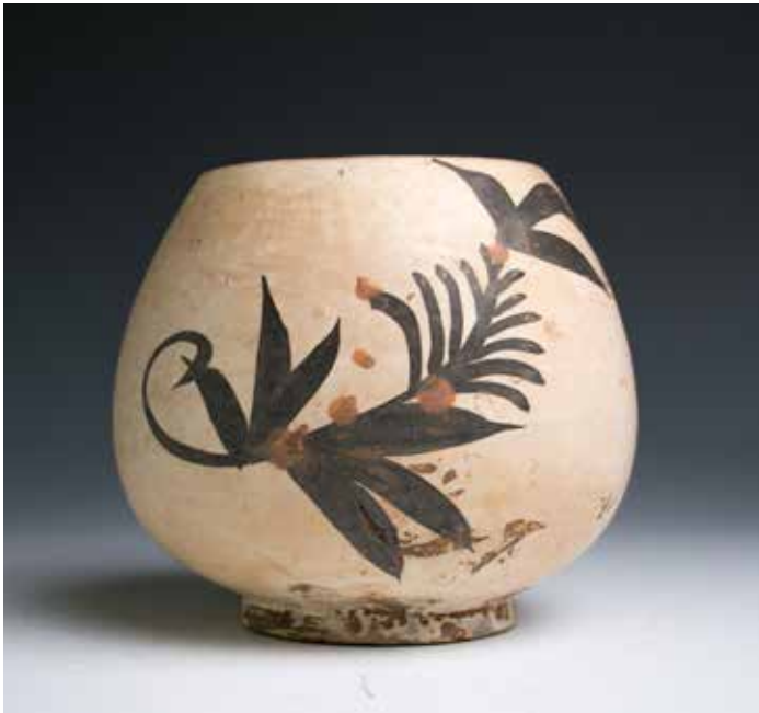
207 元至明 磁州窑花卉纹罐

Of tapered globular form, supporting on a short foot, the exterior decorated with black and orange painted twig on a pale russet glazed body, interior glazed black, the unglazed base reveals the buff body. H:13 cm