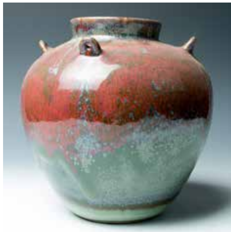
149 二十世纪 窑变釉圆形罐

Of globular form, rising to a short cylindrical neck and everted rim, four loop handles attached to the shoulder, the exterior decorated with pinkish red changing to pale green tone. H:22.5cm