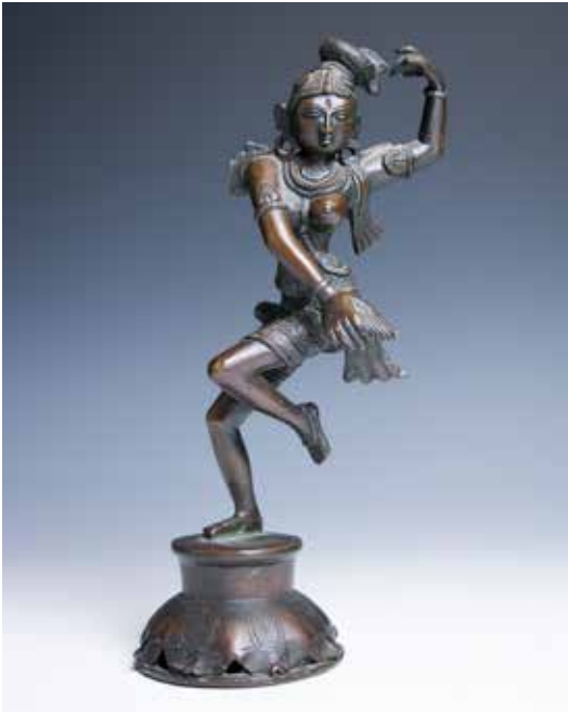
094 十八/十九世纪 印度铜制佛像

Depicting a slim dancing figure, with the whole body supported by one foot that connects to the base while the other feet raised off the ground, one hand raising overhead and the other grabbing a shell, carefully carved detail decorations. H:28.5cm