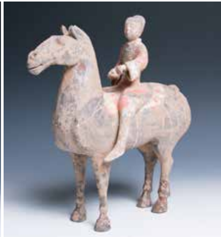
086 汉 三彩陶马骑手像

Depicting an equestrian riding on a horse, hands in the position of grabbing a missing rein, the horse standing foursquare with the head raised, the equestrian's clothes and the horse's saddle are decorated with red paint. H:28.5cm W:29cm