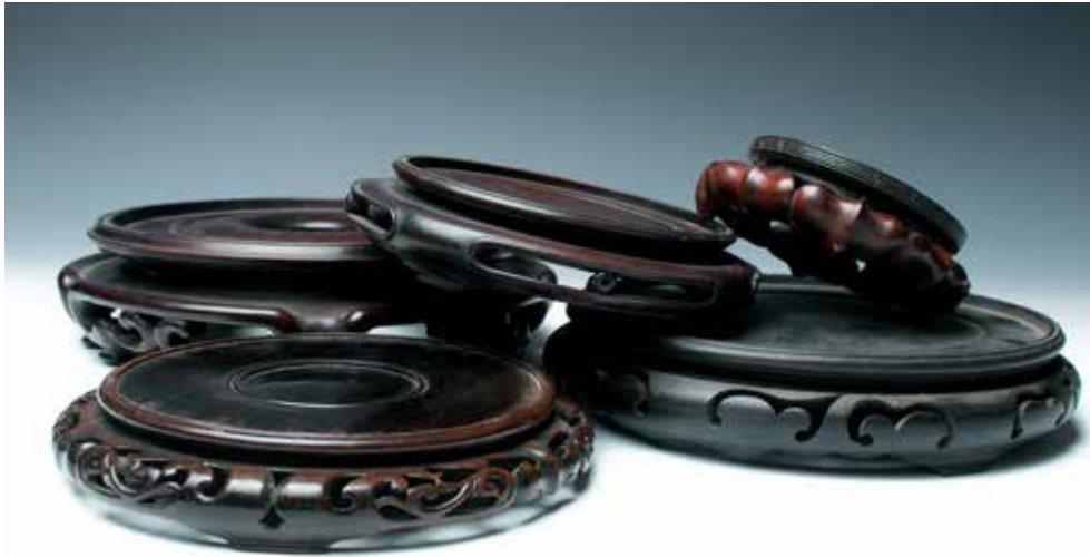
147 十九/二十世纪 圆形硬木支架 一组五个

A set of five round wooden stand, with different sizes and design. Largest Diam: 24.5cm