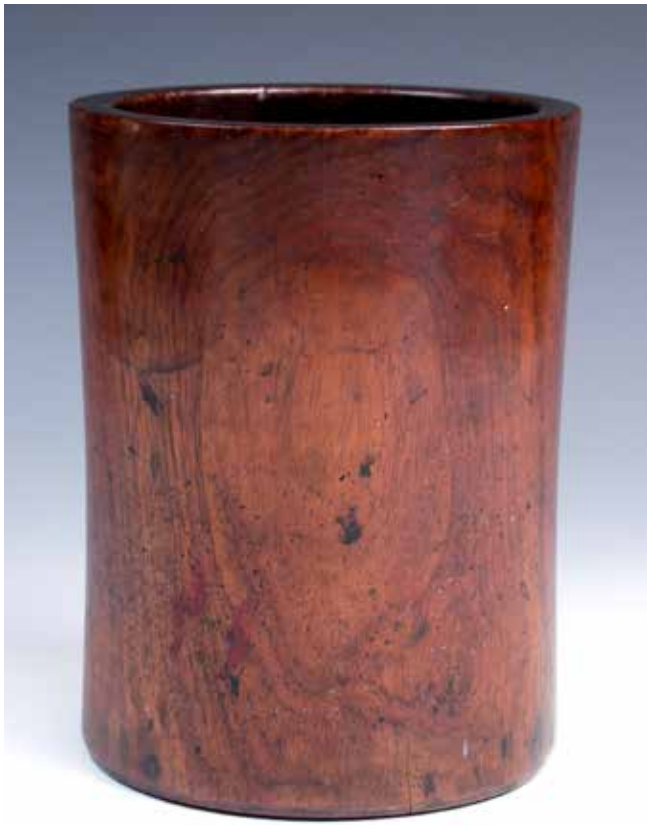
070 十八至十九世纪 黄花梨笔筒

Of cylindrical form, supported on a short foot, the material of the brush pot possibly could be Huanghuali. H: 18cm Diam:15.3cm