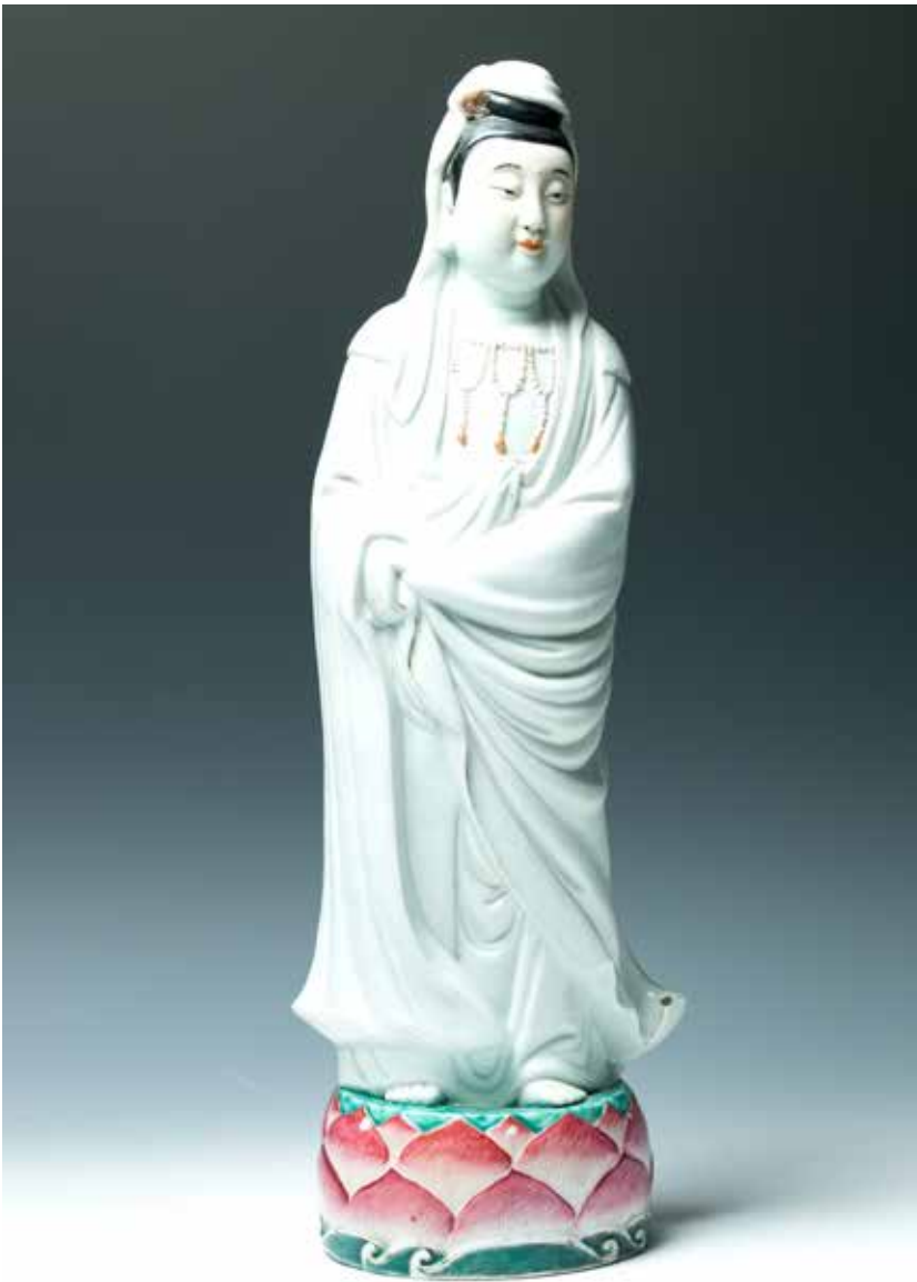
151 清 观音立像

The figure is shown standing on a lotus base with her head turned to one side, offering a serene expression, the long, flowing robes are pulled tightly around the body and draped over her head in a cowl, both hands are held in front of the body and one hidden under voluminous robes with pendant jewellery and bare feet exposed, a six-character seal is shown in low relief inside the figure. H:51cm