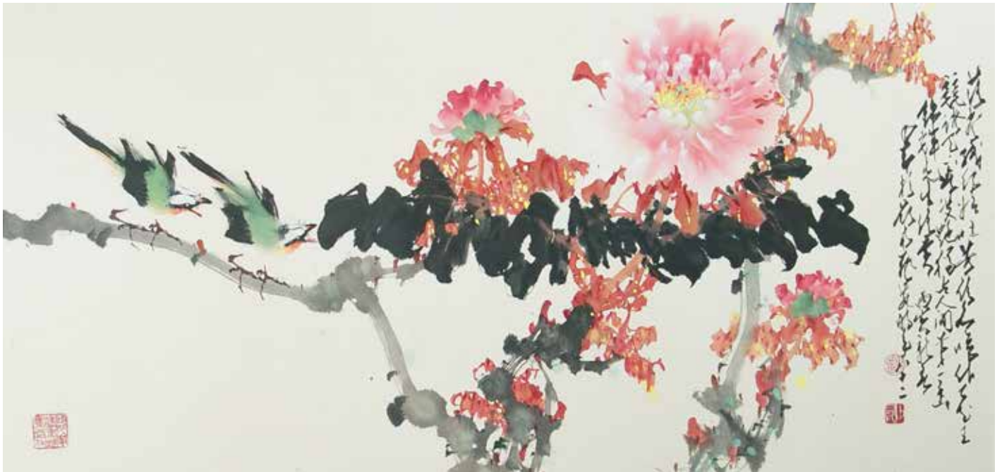
189 赵少昂 (1905-1998) 牡丹 镜心 设色纸本

Signed and inscribed, stamped with three artist's seals, depicting poney and two birds, ink and colour on paper, accompanied with original frame, from recipient. 96.5cm x 47cm