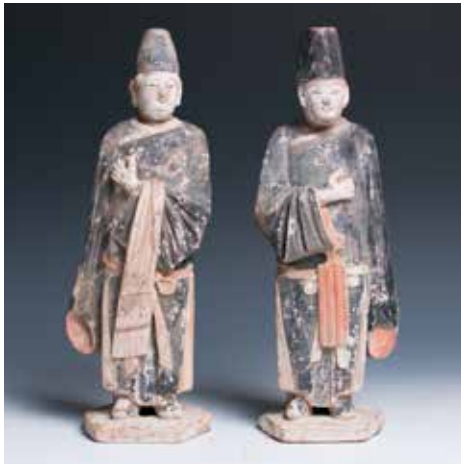
085 明 多彩陶制侍者一对

A pair of pottery figure, painted with black and red paint, in the same position with one arm reaching the chest, both wearing similar rope with a tall black hat, standing straight on a flat support, face lively depicted. H:30.5cm