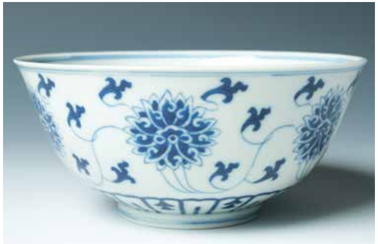
153 青花宫碗 《大清咸丰年制》款

A blue and white 'palace' bowl painted with a frieze of lotus meander above a petal lappet band on the exterior and with a similar single lotus roundel in the interior, the base with six-character Xianfeng seal. Diam: 16.5cm