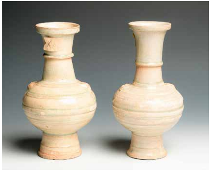
202 德化白瓷花觚 带座

Of Gu form, rising from a splayed foot to a flaring mouth, applied overall with an even white glaze, accompanied with a fitted wooden stand. H: 15.2cm