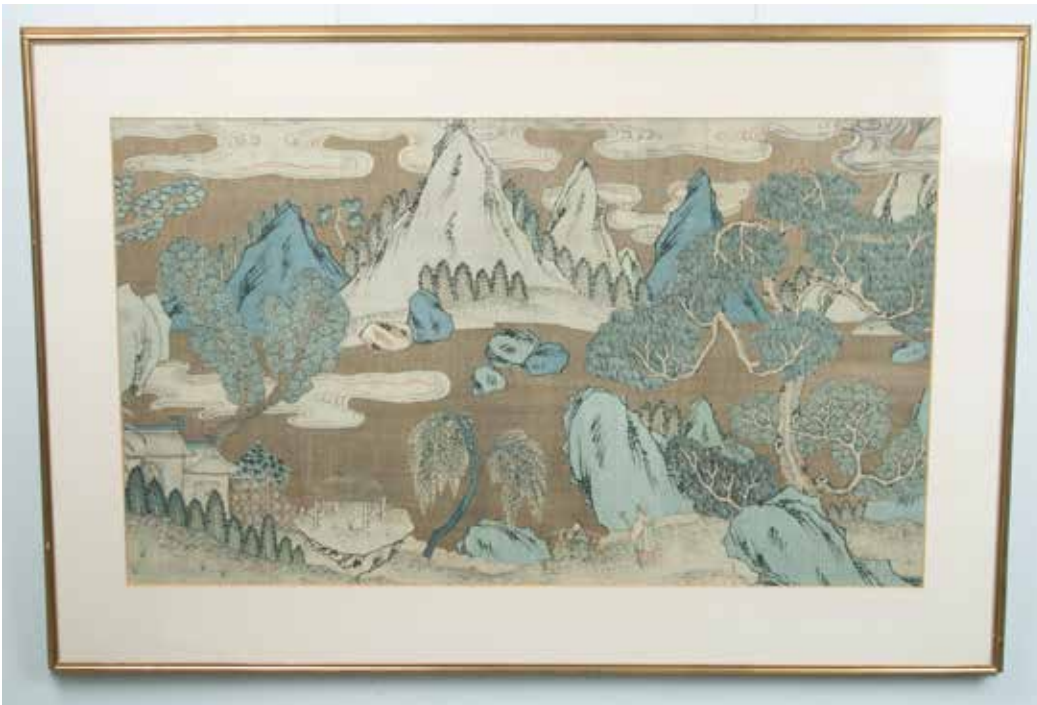
066 十九世纪 缂丝山水 带框

Woven in shades of blue, brown, pinkish red and white with house and figures amidst towering mountains, trees and scholar's stones, painted with details. 89.5cm x 53cm without frame