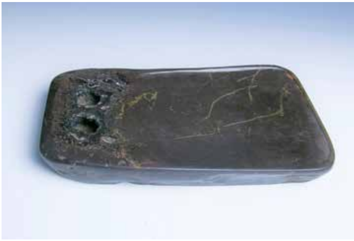
026 晚清 石砚

Of trapezoidal shape, the smooth riding surface with two holes to form the water trough. H: 26cm W:15.5cm