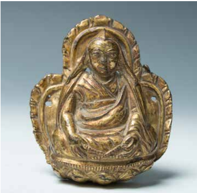
076 十九世纪早期 鎏金铜西藏达赖喇嘛像

Seated on a lotus seat, wearing voluminous robes and Pandita hat with long lappets, his arms resting on his knees and holding a string of beads. H: 10cm W: 8cm