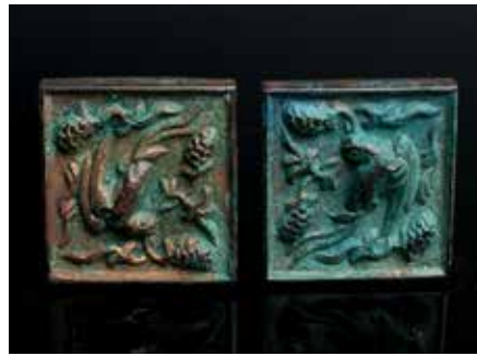
090 唐 铜制方形鹦鹉配件一对

A pair of bronze fittings, of square form, depicting parrot within interlaced flowers, the oxidized gilt surface reveals the bronze base. H: 5 cm