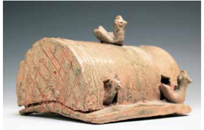
210 晋 越窑青釉鸡圈

An olive glazed porcelain ware, depicting a chicken house with three chickens either sit on the house or moving out of the house. L:13.5 cm